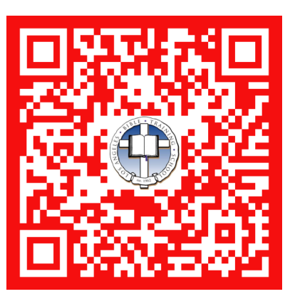
scan to register